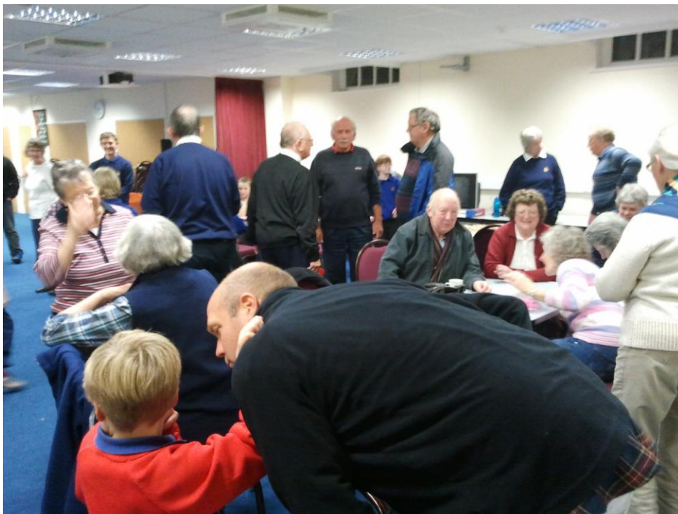
1 st Brixham Boys Brigade Open Evening at The United Reformed Church, Brixham