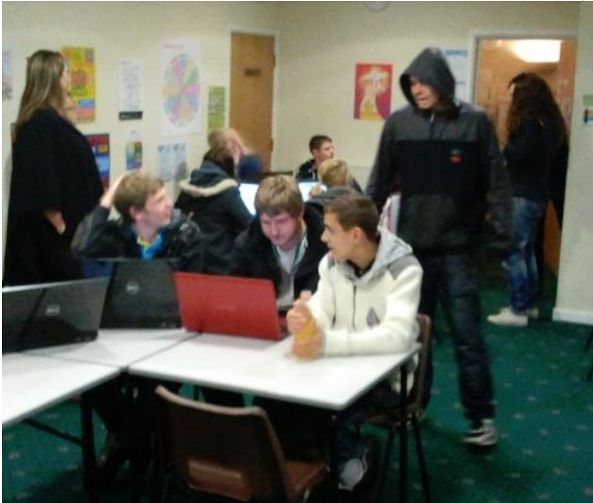
Young people at “The Place” during a Monday session

I have teamed up with the Police and have been working closely with a Police Community Support Officer (PCSO) in Brixham. Through working together, we have identified a small number of young people at risk. Both the PCSO and I have conducted home visits with young people – the aim is to explore their behaviour and look at how it impacts on the community. Often, the young people don't realise, but through the discussions and with parental support, the young people are helped to understand the impact that their behaviour has on others. Of course, this often deals with the symptoms and not the cause, so... (onto the next article)