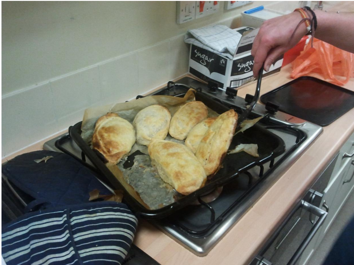
Cooking pasties at The Place – yum!!

develop a programme of activities and learning opportunities that aims to engage other young people in the town. Since the start of term, the young people have done art workshops, cooking sessions, craft evenings, information sessions with South Devon College as well as looked at issues around lifestyle choices. Currently, the young people are looking at organising quiz nights and working towards a Christmas event... I hope that involves food too!