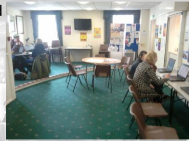
Young People Job Searching