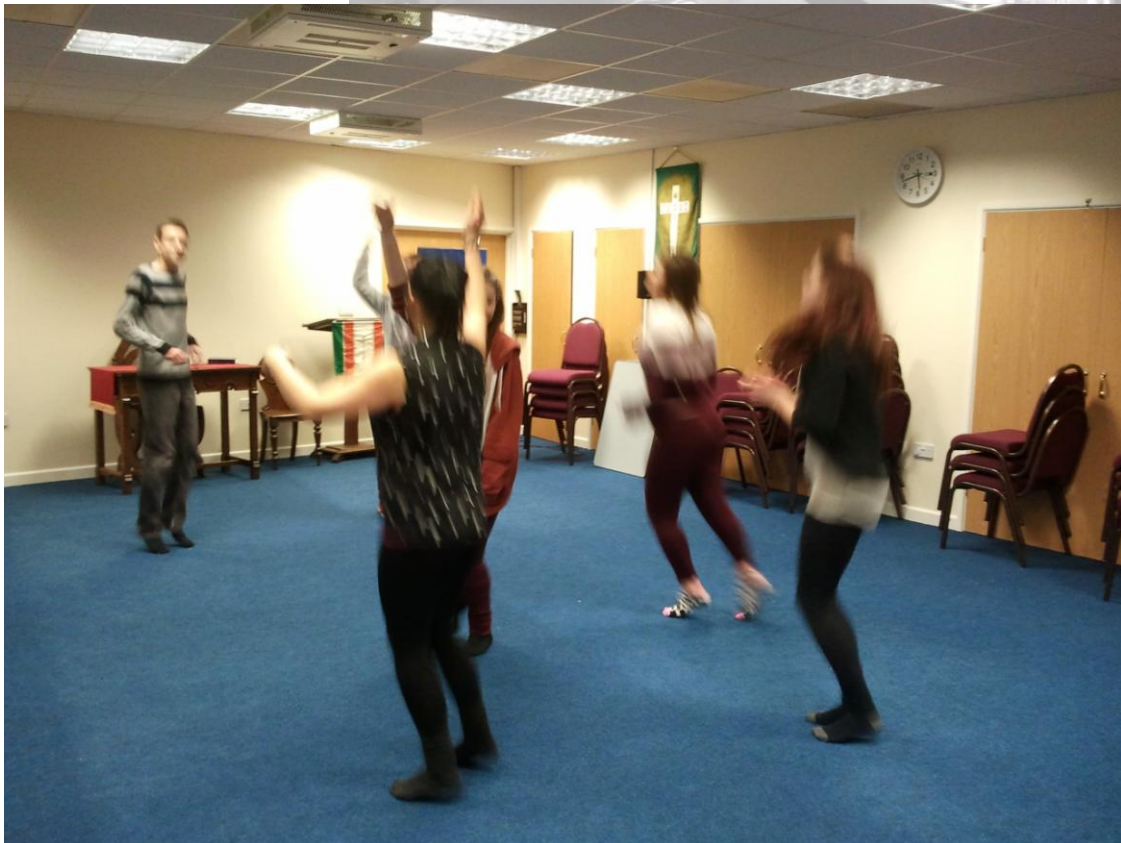
Mime-A-Like Dance Rehearsal

Some of the young people that we have been working with have formed a dance group which meets on Fridays from 5-7pm. They call themselves "Mime-a-like" because they say you either love em' or you hate em' (of course, it's a reference Marmite)! The "mime" part of their name comes from the fact that they wear outfits that are similar to Mime Artists during their performances. They last performed at Brixham College at Christmas, their next planned debut will be at the Youth Genesis Commissioning Service which is being held at Fore Street Methodist Church, Brixham on Saturday 27 th April 2013 at 3pm. So, if you would like to see a most excellent performance of this extraordinary dance group, please be there!!